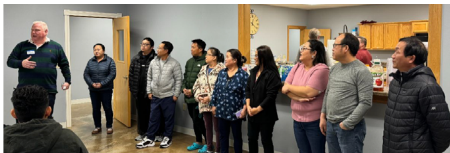
This team from Reborn in Christ Baptist Church provided and served the lunch at the SWBA annual meeting in November.

Hill City Baptist Church was blessed by Northland Missions late last year as they faced covering the cost of replacing a roof. The cost was around $15,000. Northland Missions gave $3,500 and another Northland Missions church gave an additional $3,500.