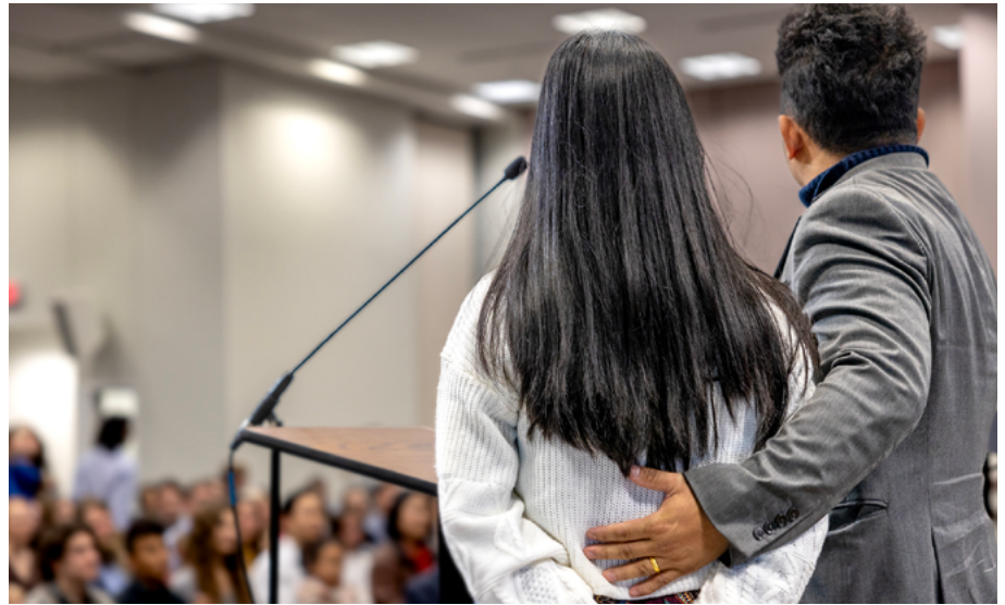
The first Burmese-American Southern Baptist missionaries sent through IMB speak during their commissioning service December 7, near Richmond, Va. “We have a chance to go to an unreached nation,” they said. “We will carry on that vision.”

Judson said: “The poor Burmans are entirely destitute of those consolations and joys which constitute our happiness; and why should we be unwilling to part with a few fleeting, inconsiderable