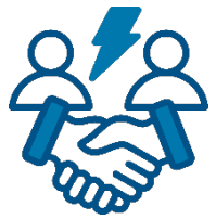
Conflict Prevention Techniques

Beyond the portfolios of physical security resources noted above, CISA offers the following services, tools, and guidance to stakeholders: