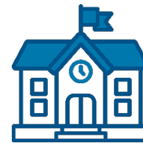
School Safety schoolsafety.gov