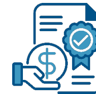
FEMA Grants fema.gov/grants/preparedness/about/ state-administrative-agency-contacts